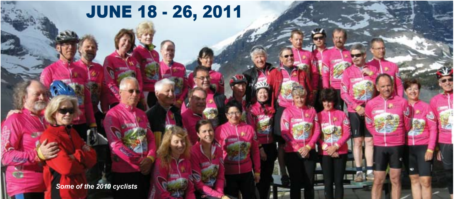
Some of the 2010 cyclists